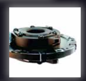
Multi Panel 60